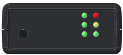
Read Switch Connector